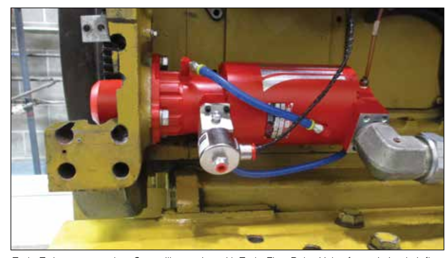
TurboTwister mounted on Caterpillar engine with TurboFlow Relay Valve for optimized air flow