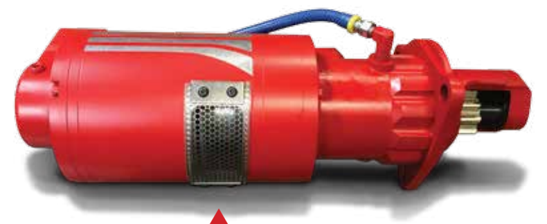
New Downward-Directed Exhaust & Screen